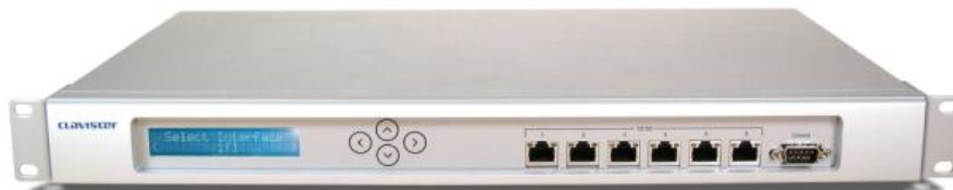
Figure 1.2. Front view of the Clavister SG3100 Series.

The SG3100 features a number of connection ports. On the far right is the RS232 console port. The device's display and keypad is located on the far left. In between is an array of 6 x RJ45 Ethernet ports