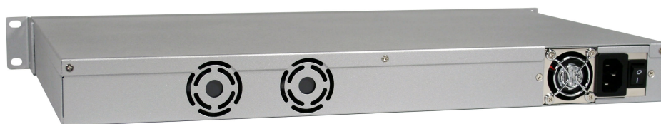
Figure 2.2. Rear view of the Clavister SG3100 Series.

The image below shows the back of the SG3100 Series. To the extreme right is the power cord socket. To the left of the socket is a recessed button for resetting the device to factory defaults.