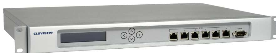
Figure 1.1. An Unpacked Clavister SG3100 Series Appliance