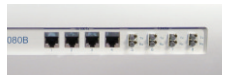
Clavister XC4080B with 4 copper and 4 fiber gigabit Ethernet interfaces.

The products in the XC-Series can be successfully combined with the Clavister VPN Client software and with products and services from Clavister's technology partners, for instance Verisign and Rainbow Technologies.