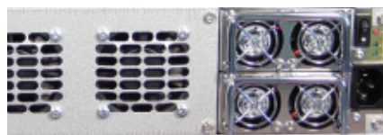
Hot-swappable, redundant backup power supplies in the Clavister XC4080 ensures a reliable system.

The most common cause of operational interrupts in computer hardware is faulty hard drives. This is the reason why none of the Clavister Firewall Appliances make use of hard drives.